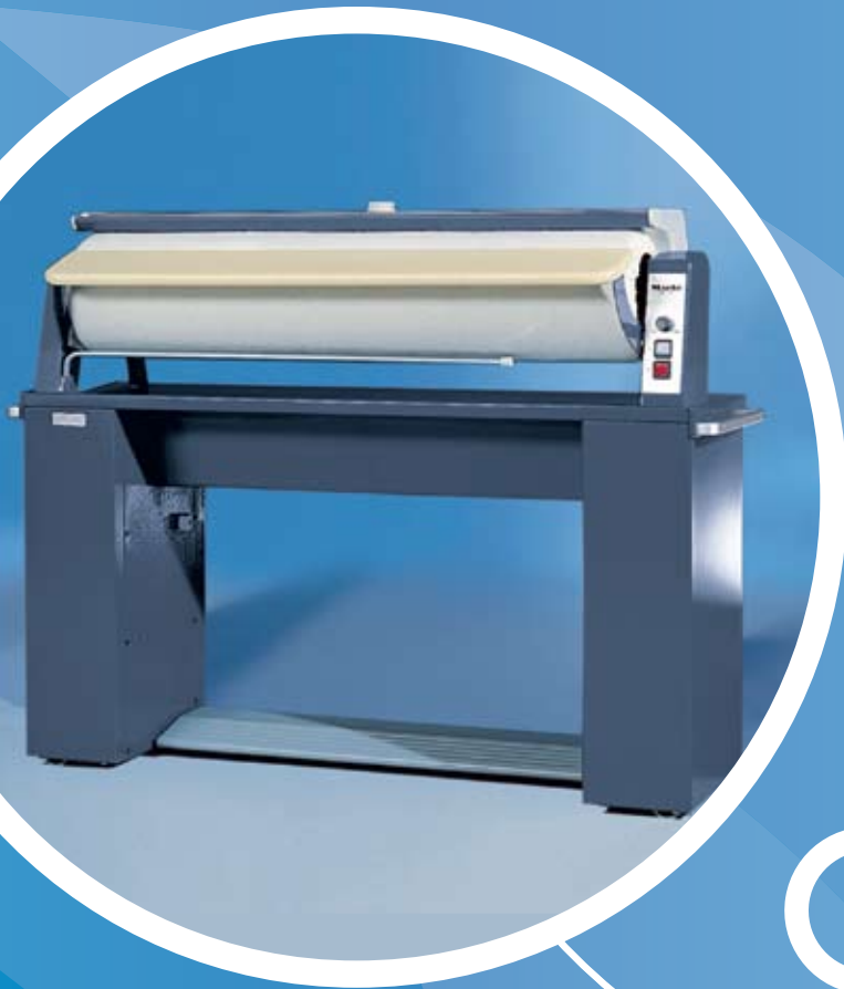
Table & roller ironers professional ironing solutions