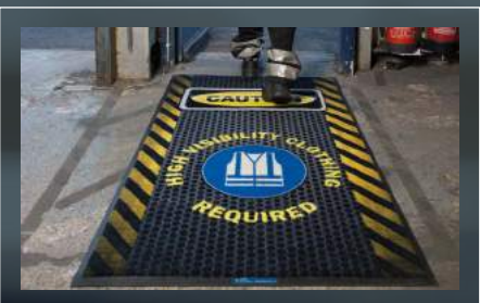
Image mats can be used in many ways, i.e as an alternative method of health & safety signage, such as reminding staff and visitors to wear ear plugs or hi vis jackets

Why? Image mats offer limitless branding potential, and are a great alternative to on-site signage.