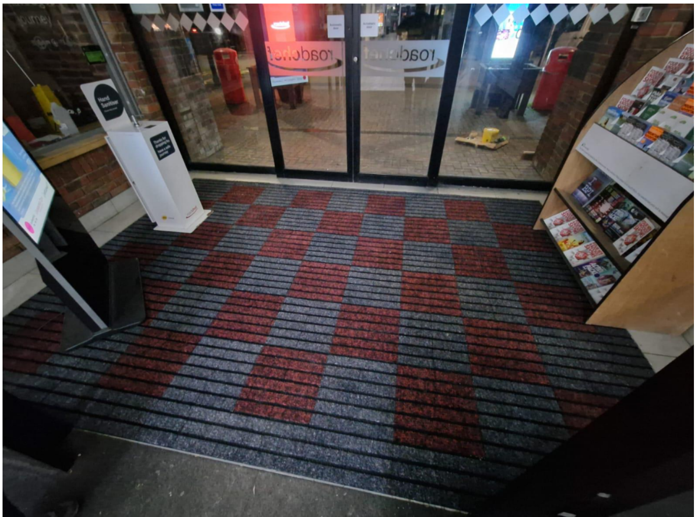
Forma HD with Tergo HD

Negates any clearance issues in entrance points & doorways