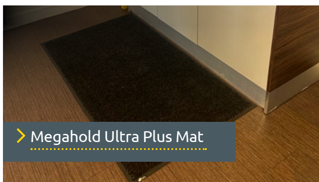
> Megahold Ultra Plus Mat

Loose-lay logo mats offer an easy way to incorporate brand identity into a building while boosting health and safety. From receptions to board rooms, logo mats present powerful and professional statements in key locations across businesses.